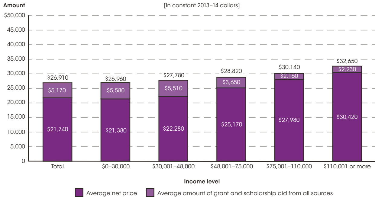
Figure 4. Average total price, net price, and grant and scholarship aid for first-time, full-time students receiving aid at private for-profit 4-year institutions, by family income level: Academic year 2012–13

NOTE: Excludes students who previously attended another postsecondary institution or who began their studies on a part-time basis. Includes only first-time, full-time students who received Title IV aid. Excludes students who did not receive any Title IV aid. Title IV aid includes grant aid, work-study aid, and loan aid; however, the calculation of net price does not take into account student loan aid. Data are weighted by the number of students at the institution receiving Title IV aid. Detail may not sum to totals due to rounding.