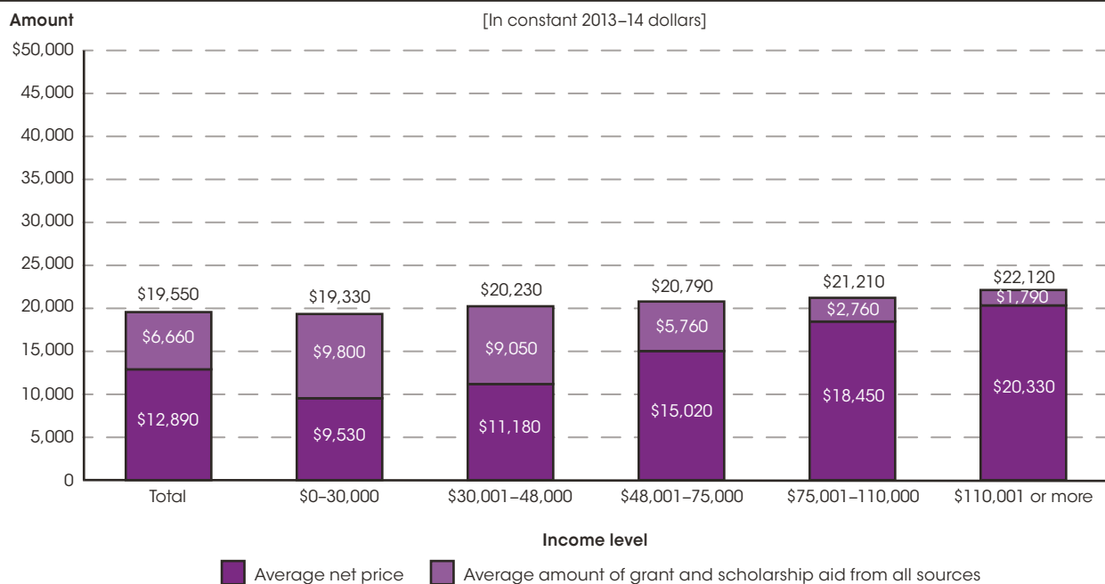
Figure 2. Average total price, net price, and grant and scholarship aid for first-time, full-time students paying in-state tuition and receiving aid at public 4-year institutions, by family income level: Academic year 2012–13

NOTE: Excludes students who previously attended another postsecondary institution or who began their studies on a part-time basis. Includes only first-time, full-time students who paid the in-state or in-district tuition rate and who received Title IV aid. Excludes students who did not receive any Title IV aid. Title IV aid includes grant aid, work-study aid, and loan aid; however, the calculation of net price does not take into account student loan aid. Data are weighted by the number of students at the institution receiving Title IV aid. Detail may not sum to totals due to rounding.