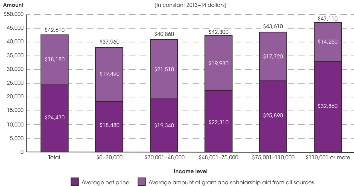
Figure 3. Average total price, net price, and grant and scholarship aid for first-time, full-time students receiving aid at private nonprofit 4-year institutions, by family income level: Academic year 2012-13

NOTE: Excludes students who previously attended another postsecondary institution or who began their studies on a part-time basis. Includes only first-time, full-time students who received Title IV aid. Excludes students who did not receive any Title IV aid. Title IV aid includes grant aid, work-study aid, and loan aid; however, the calculation of net price does not take into account student loan aid. Data are weighted by the number of students at the institution receiving Title IV aid. Detail may not sum to totals due to rounding.